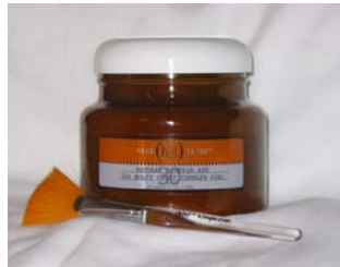
H2t Pumpkin Peel